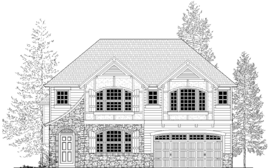
*Select elevation features shown are optional.