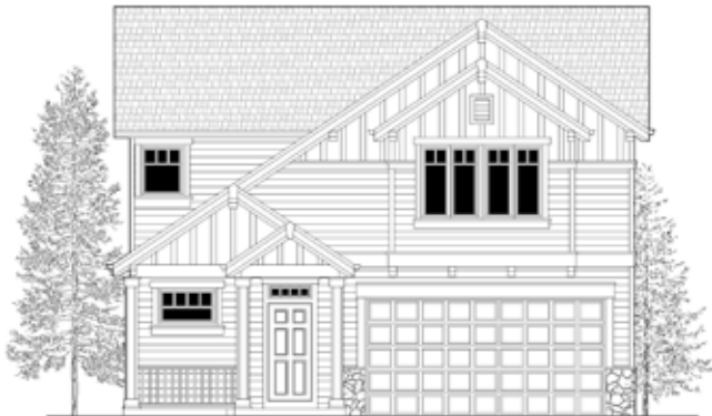
Spencer A - Northwest*