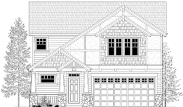
Spencer B - Craftsman*