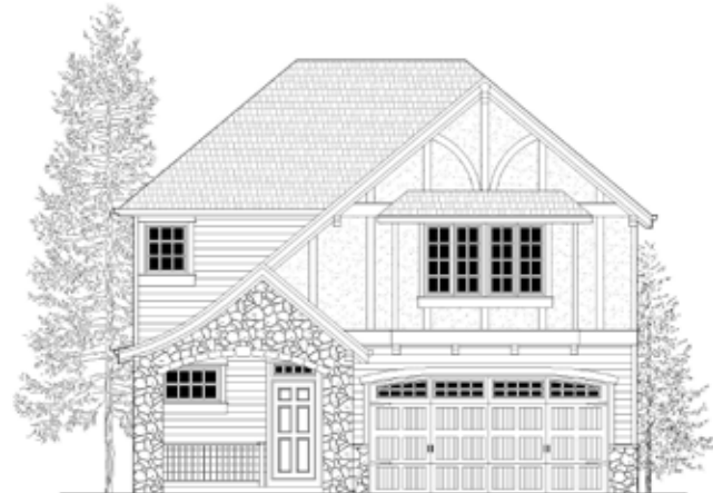
Spencer C - Euro Craftsman*

*Select elevation features shown are optional.